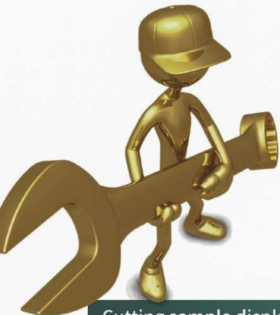
Cutting sample display