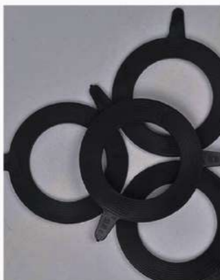
Seal Industry Gasket